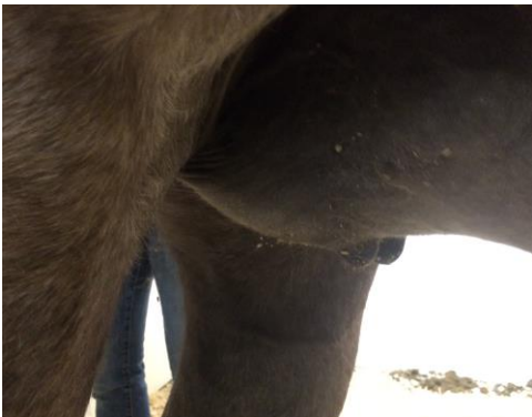
Septic foal born from a mare diagnosed with bacterial placentitis