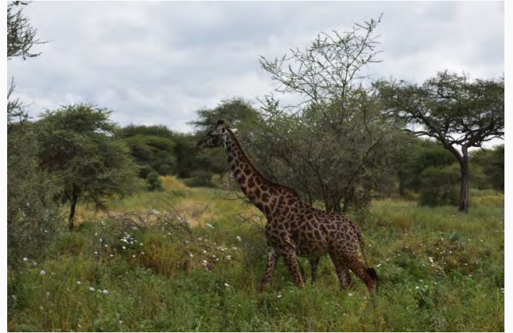
Giraffe Cervus camelopardalis