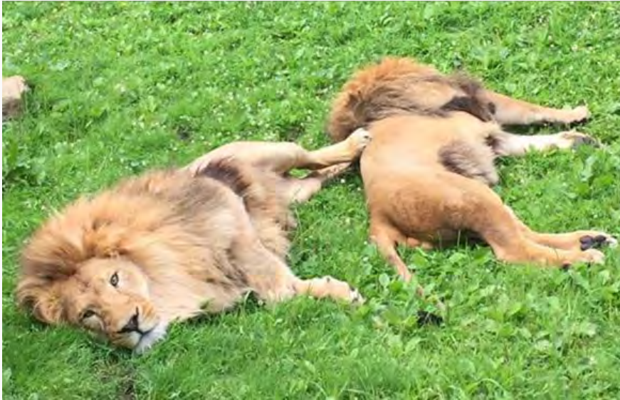
African Lion Panthera leo