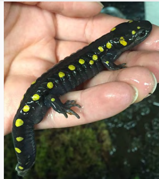
Spotted Salamander Ambystoma maculatum