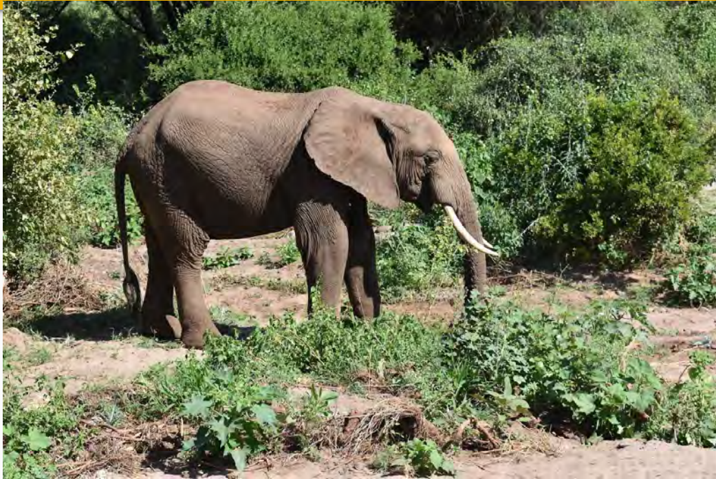
African Elephant Loxodonta africana