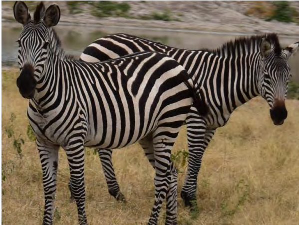
Common Zebra Equus quagga