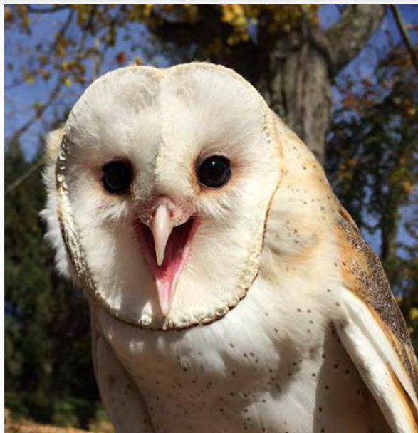
Barn Owl Tyto alba