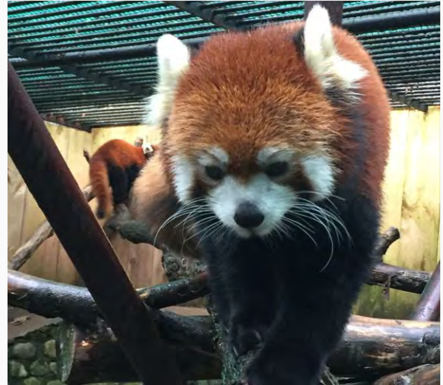
Red Panda Ailurus fulgens